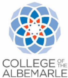
Division of Health Sciences & Wellness Programs 2022-2023 Organizational Chart