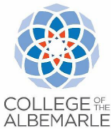
Division of Health Sciences & Wellness Programs 2022-2023 Organizational Chart