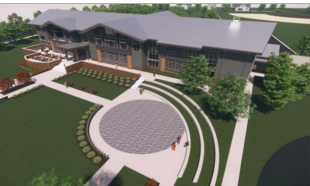
New COA - Dare facility: allows for consolidation to one location and provides state-of-the art facilities for current and future education programs

For more than 60 years, College of The Albemarle has been committed to meeting the educational needs of our seven county service area. Over time, those needs evolve and COA is once again growing to keep pace. This past year saw the beginning of two new capital projects designed to help us continue transforming lives, families and communities.