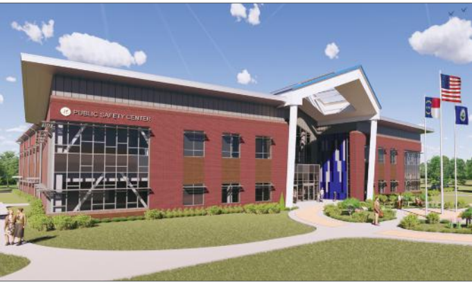
Currituck County Public Safety Center: future home of COA Basic Law Enforcement, Emergency Medical Science and Nurse Aide programs

For more than 60 years, College of The Albemarle has been committed to meeting the educational needs of our seven county service area. Over time, those needs evolve and COA is once again growing to keep pace. This past year saw the beginning of two new capital projects designed to help us continue transforming lives, families and communities.