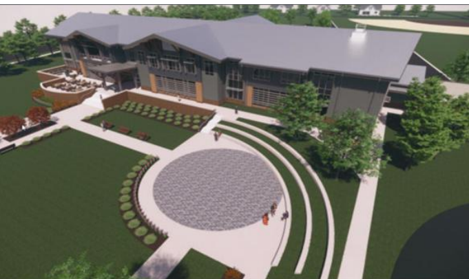
New COA – Dare facility: allows for consolidation to one location and provides state-of-the art facilities for current and future education programs